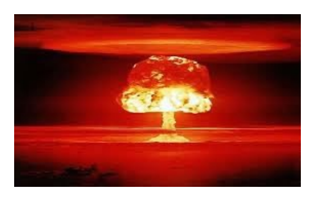
THE DAY OF THE LORD

And the trajectory of such a weapon is accurately described in this passage. While a ripe fig might fall directly to the ground when there is no wind, the trajectory of a fig tossed from a tree in a storm is very similar to the trajectory of a nuclear warhead delivered by a ballistic missile. In addition, when a nuclear weapon is detonated, the edges of the mushroom cloud roll like the two sides of a scroll, as the fireball and mushroom cloud rise into the sky.